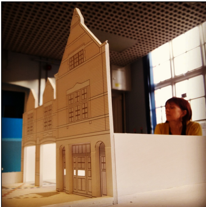
Image: Model of Maindee Library made by Huw Mereddyd Owen for CAT2 project submission

We must always have an eye towards the revenue-earning potential for the space. The current business model assumes a library completely managed by volunteers with no paid staff.